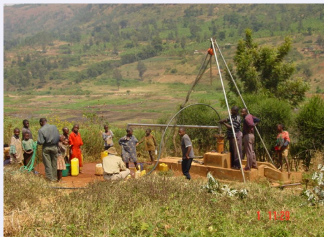
Borehole testing and cleaning Kibungo Eastern Province Rwanda

Water and waste water treatment solutions