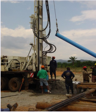
Installation of borehole casing CICR Burundi, Rumonge

The company's managers and senior staff have many years related experience in the key fields of services offered. Through its network of associated engineers and other professionals in management and agricultural sector the company is able to assist our esteemed clients with projects outside our main target area in the water sector.