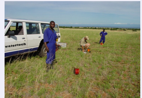
Hydrogeological & Geological Survey Hardman Petroleum Drilling Site at Lake Albert Uganda

This requires professional input and Watertech Services is dedicated to help you obtain this goal.