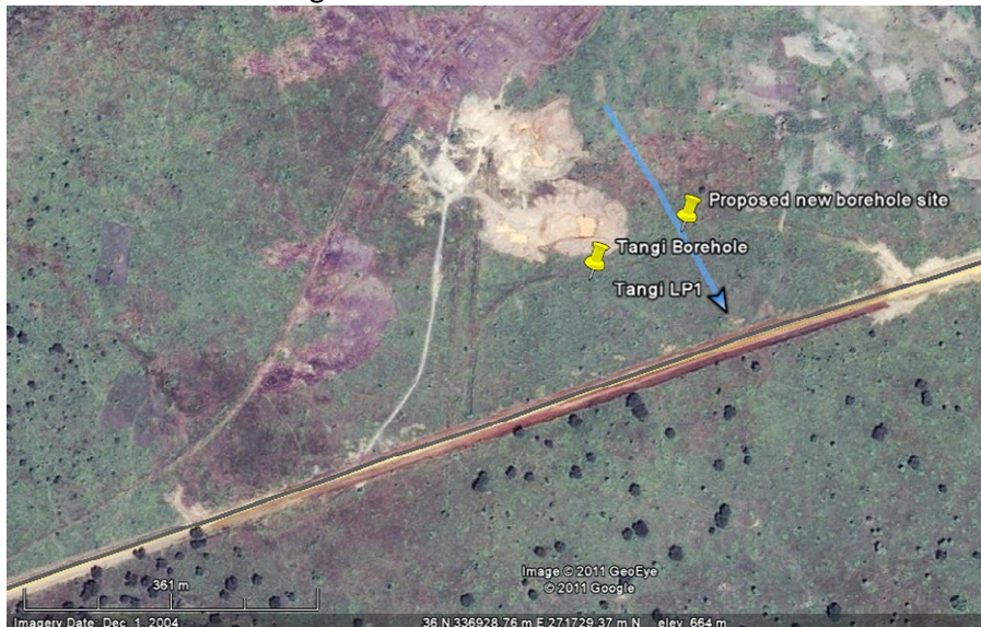
Tangi Camp new BH site